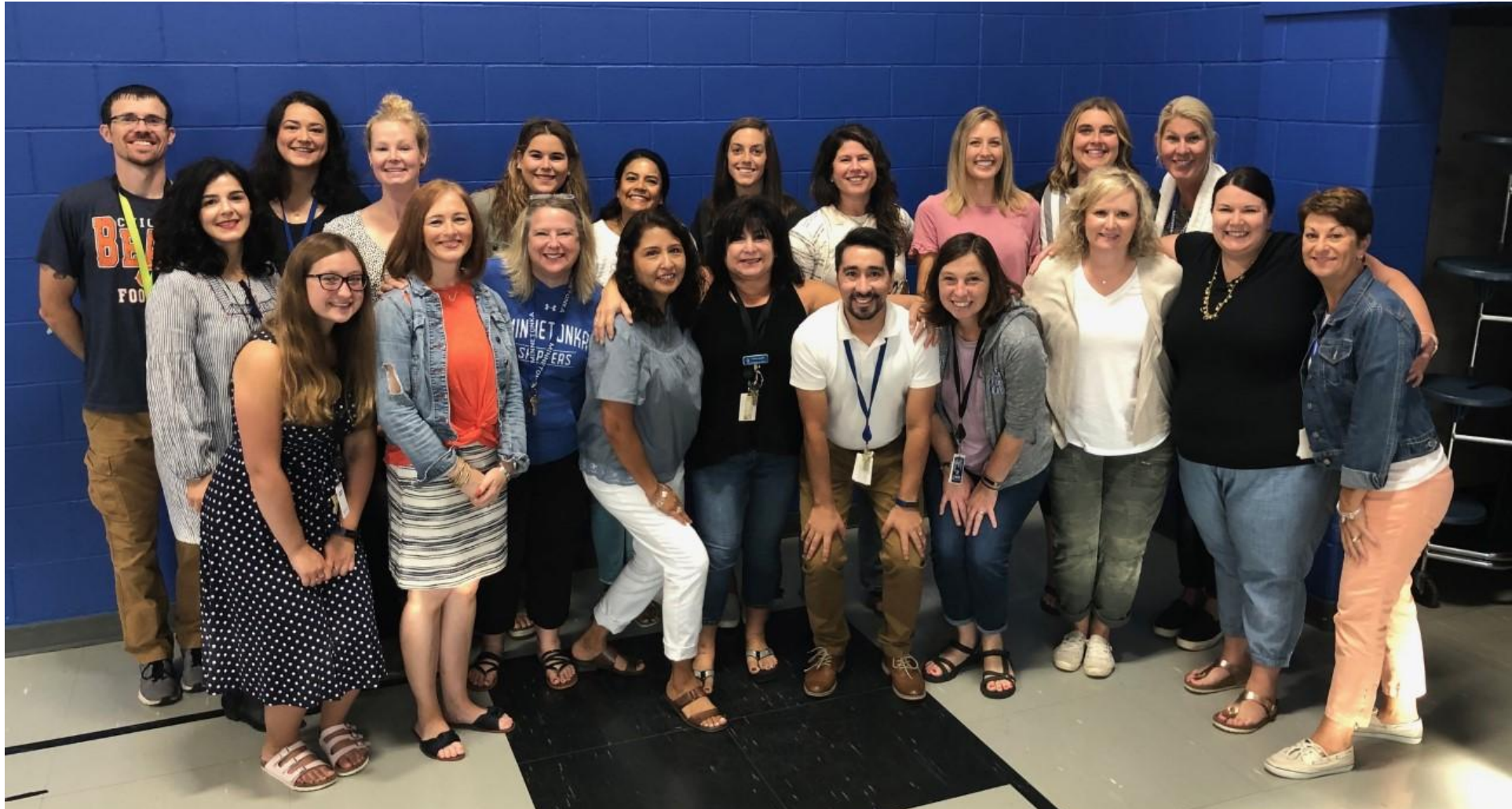
Minnewashta Kindergarten Staff