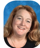
MARGARET MCDONALD ADVANCED LEARNING